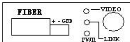
Fig 1. Front Panel

There are “POWER”, “VIDEO”, “LINK” LEDs in the front panel